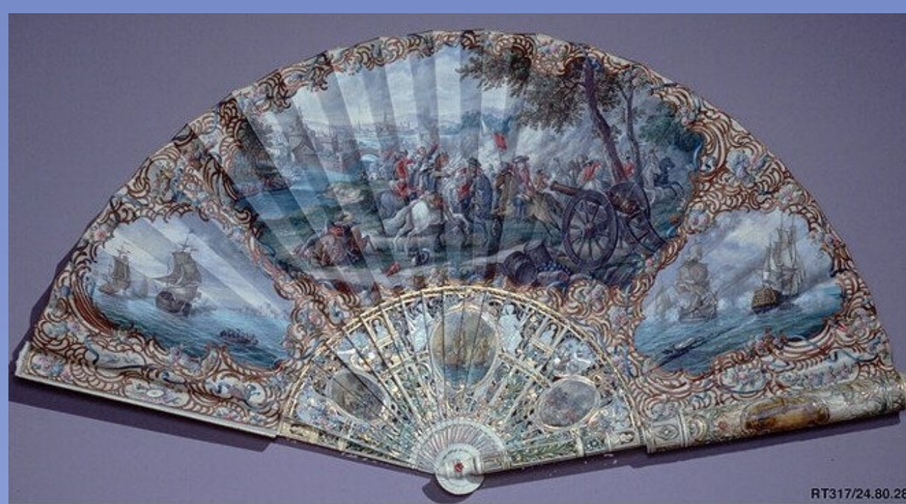
Figure 3: Very elaborate fan with gilding and painted skin. The Metropolitan Museum of Art, European Sculpture and Decorative Arts. Accession Number: 24.80.28

Hand fans have been in use for hundreds of years, but were introduced to Europe later in the 13 th and 14 th centuries from Asian countries through trade (Steele 2002). Fans gained widespread popularity in Europe during the next several centuries and, by the 18th century, fan-makers were producing highly elaborate and detailed fans. These could be commissioned by wealthy ladies of the period and often were made of precious materials such as ivory, mother of pearl, exotic woods and fine fabrics or animal skins (Mayor 1980). Many fans featured hand painted paper or silk leaves with scenes that depicted military accomplishments, maps, dance steps, biblical scenes, and landscapes (Fig. 3).