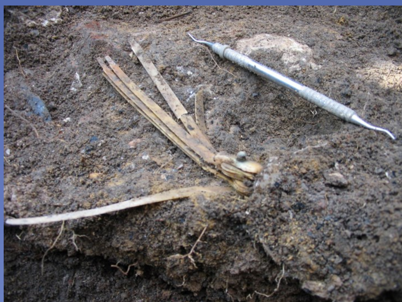
Figure 1a. Smith's St. Leonard fan uncovered at site.

The Smith's St. Leonard fan is missing the paper section at its end that made the fan able to move air. This section is called the "leaf" (Webber 1984). It can be assumed that the paper or fabric decomposed over time, but because it seems likely the fan was broken when discarded, it is also possible that the leaf was removed. Some of the sticks (the thin pieces of ivory attached to the rivet) on the fan are broken, and the ribs which attached the leaf to the sticks have either broken off or decomposed. A complete copper alloy rivet holds the sticks together so they can be spread apart or closed. While the ends of these rivets are sometimes decorated with a gem or paste stone, this one is plain (Bradfield 1997). The sticks are mostly undecorated, and do not have any gilding, paint or inlays on them as some 18th century fans had. The bases of the sticks are carved with an "S"-like pattern. This pattern creates areas between the sticks when open, adding to the overall decoration of the fan (Fig. 2).