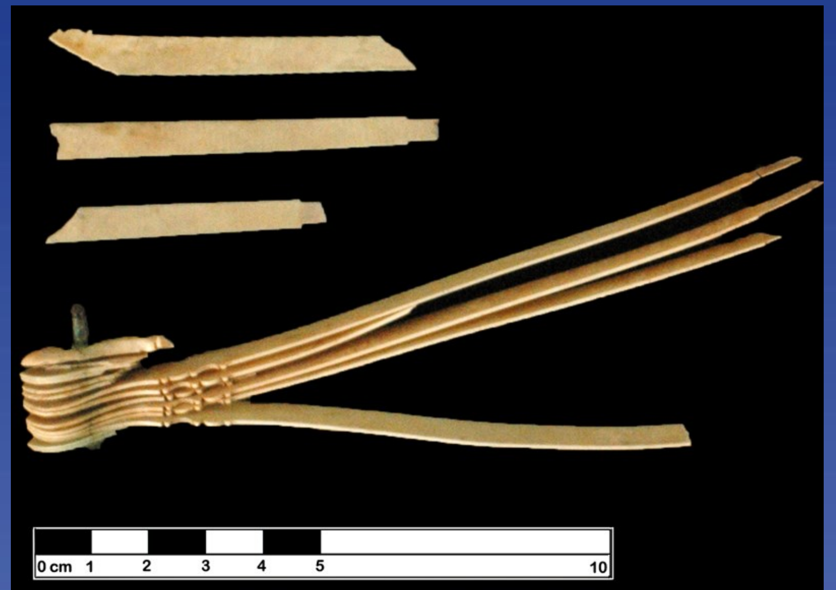
Figure 1: Smith's St. Leonard fan after conservation treatment. Many of the sticks are broken, and the top portion of the fan is gone.

During the fall 2011 excavations at the Smith's St. Leonard site, located at Jefferson Patterson Park and Museum, archaeologists worked to excavate a kitchen cellar that had been filled with trash and then covered with a brick surface. The cellar artifacts appear to date from the middle of the 18 th century. Because of this, it is possible the cellar could have been filled in around 1748 when the property changed hands several times due to deaths in the Smith family (Fig. 1). Among the rubble and shell that filled a stratum layer roughly halfway down through the feature was the remains of an ivory hand fan.