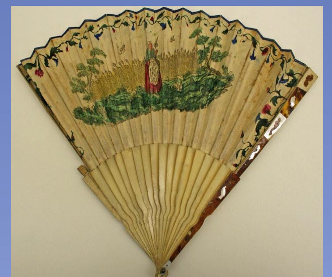
Figure 4: This fan could be similar to the Smith's fan. The sticks are plain, but the paper section is hand painted. Notice the side where the stick ends, and the paper has detached from it. The ivory section is only about half the total length of the fan. Metropolitan Museum of Art Collection, accession number C.I.44.8.82

In comparison to some of these fancier fan types, the Smith's St. Leonard fan seems plain. Possibly, most of the decoration had been on the leaf, which is now gone. The sticks also could have been painted at one point, but there is no longer any residue from paint or gilding. It is hard to get an impression of what the fan may have looked like while it was in use, but its presence, along with the other artifacts in the cellar, provides for a deeper understanding of the Smith Family (Fig 4 and 5).